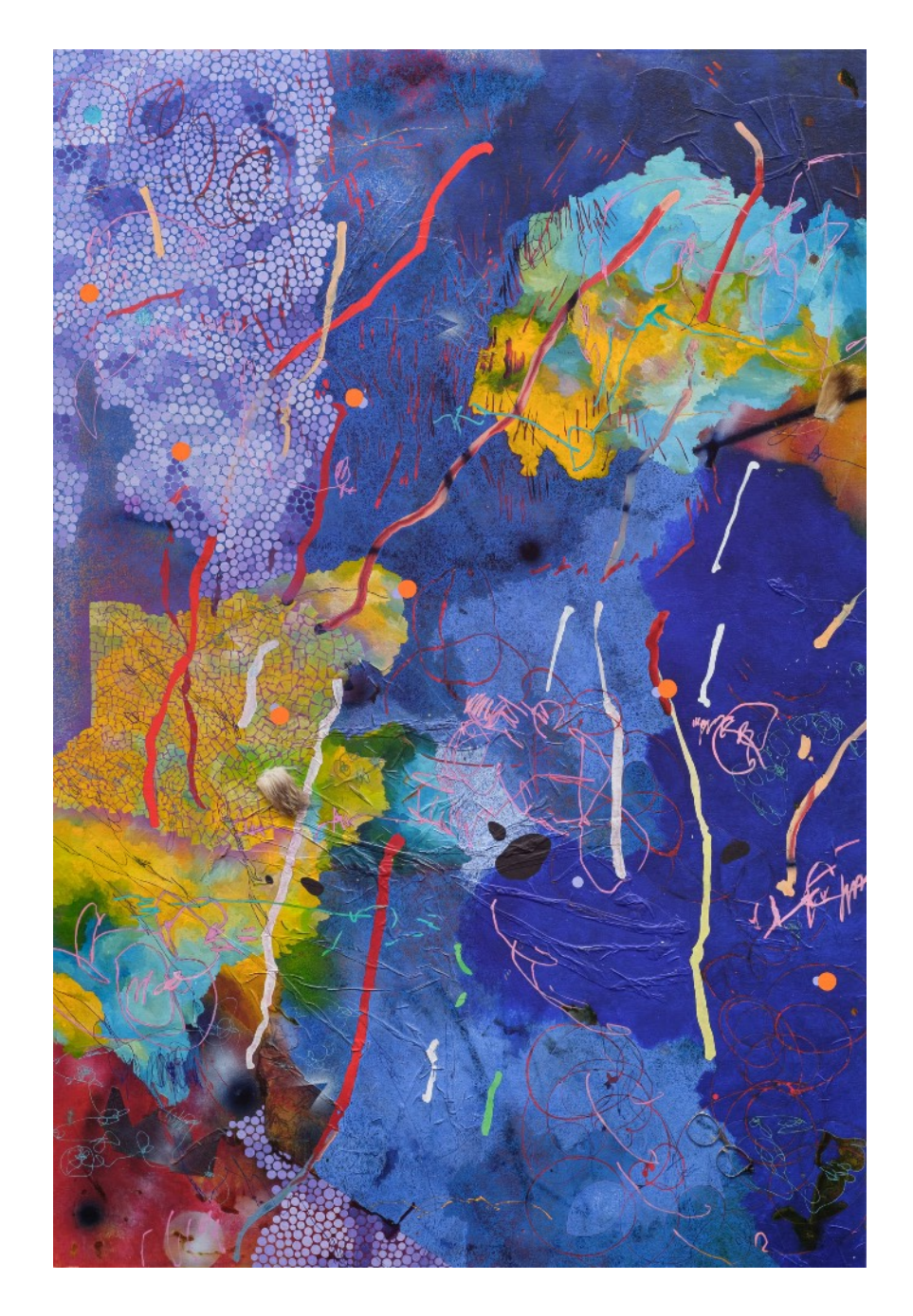
7 January 2020, Acrylic and mixed media on linen, 210 (H) x 140 (W) x 3.5cm (D), $12,500