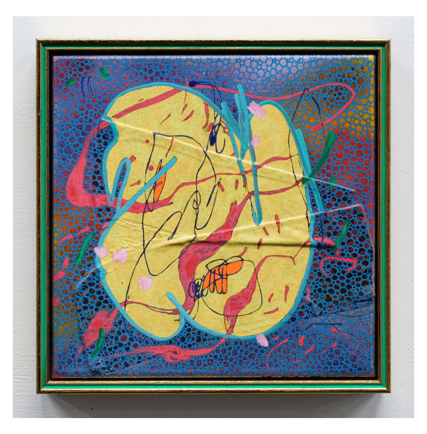
11 February 2020, Acrylic and mixed media on linen, 33 (H) x 33 (W) x 5.5 cm (D), $1,900