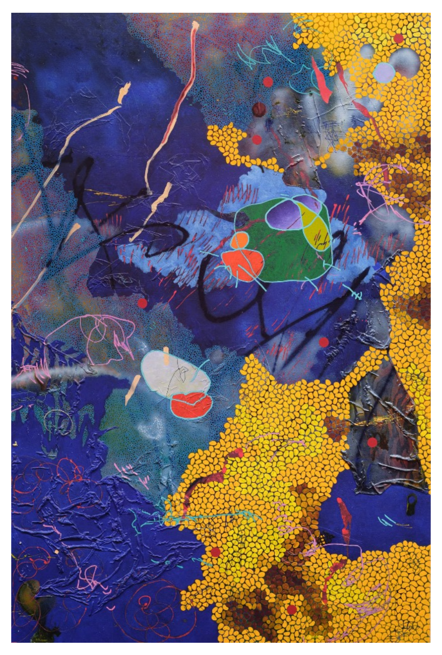
25 January 2020, Acrylic and mixed media on linen, 210 (H) x 140 (W) x 3.5 cm (D), $12,500