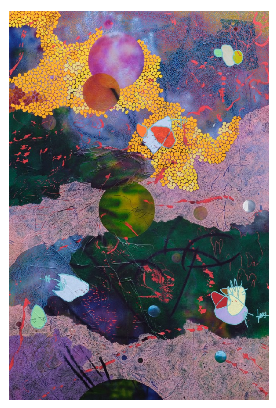
10 January 2020, Acrylic and mixed media on linen, 210 (H) x 140 (W) x 3.5 cm (D), $12,500