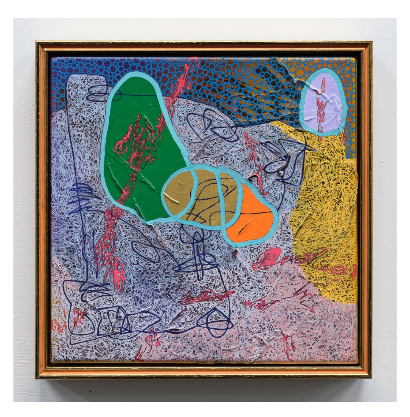
10 February 2020, Acrylic and mixed media on linen, 33 (H) x 33 (W) x 5.5 \mathrm{cm} (D), $1,900