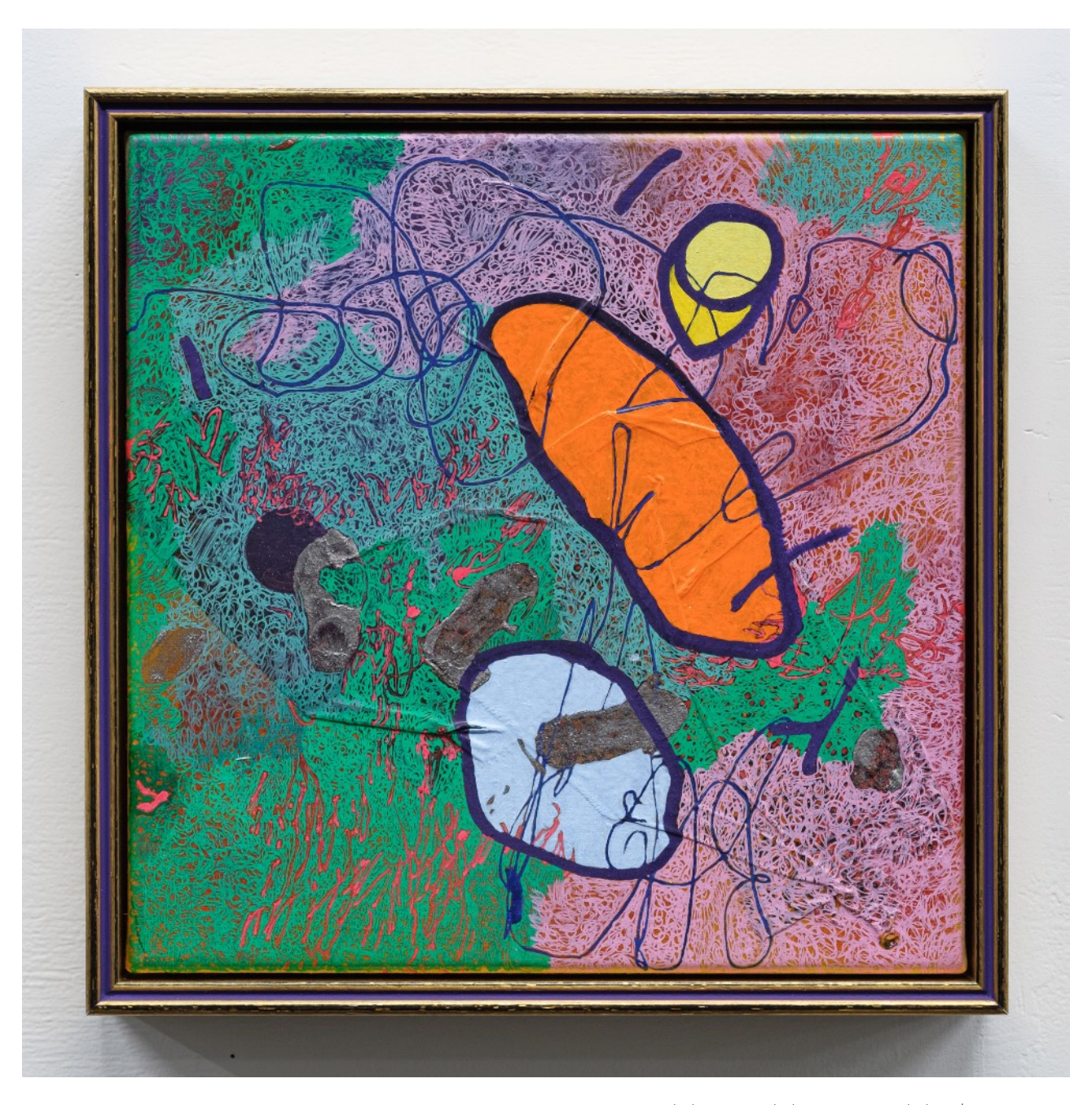
27 January 2020, Acrylic and mixed media on linen, 33 (H) x 33 (W) x 5.5cm (D), $1,900