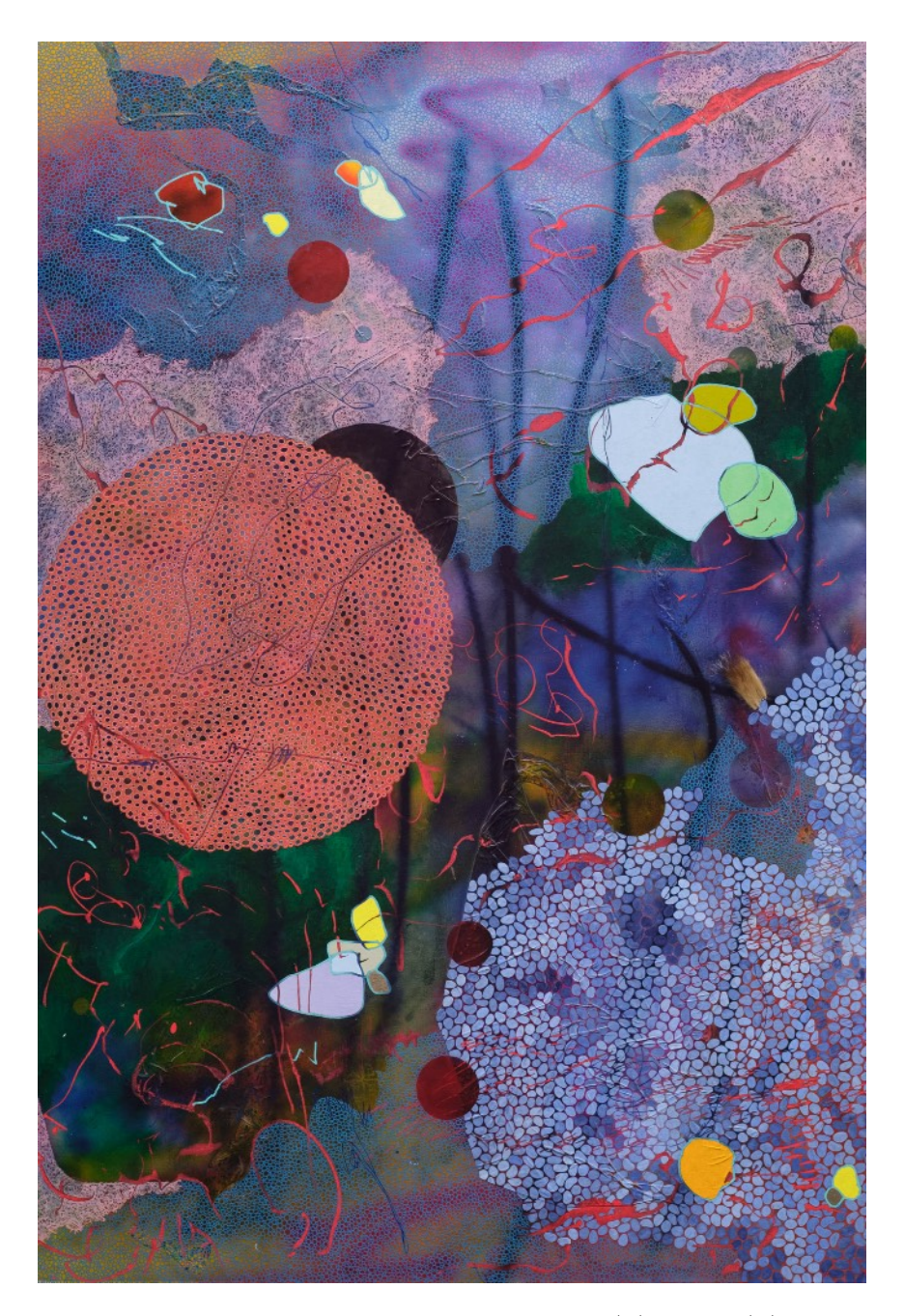
29th February 2020, Acrylic and mixed media on linen, 210 (H) x 140 (W) x 3.5cm (D), $12,500