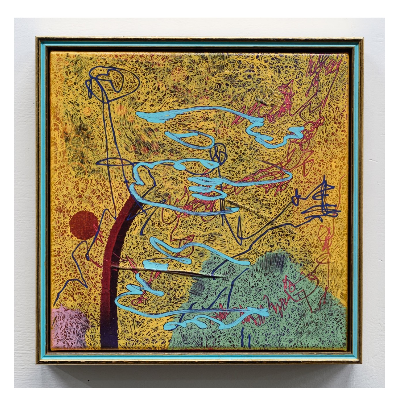
24th February 2020, Acrylic and mixed media on linen, 33 (H) x 33 (W) x 5.5 cm (D), $1,900